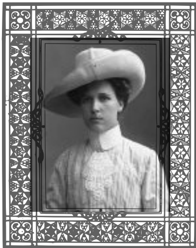
the Baroness von Platen

Flatbread with smetana, västerbotten cheese, chèvre, parmesan & pickled red onion *** 189